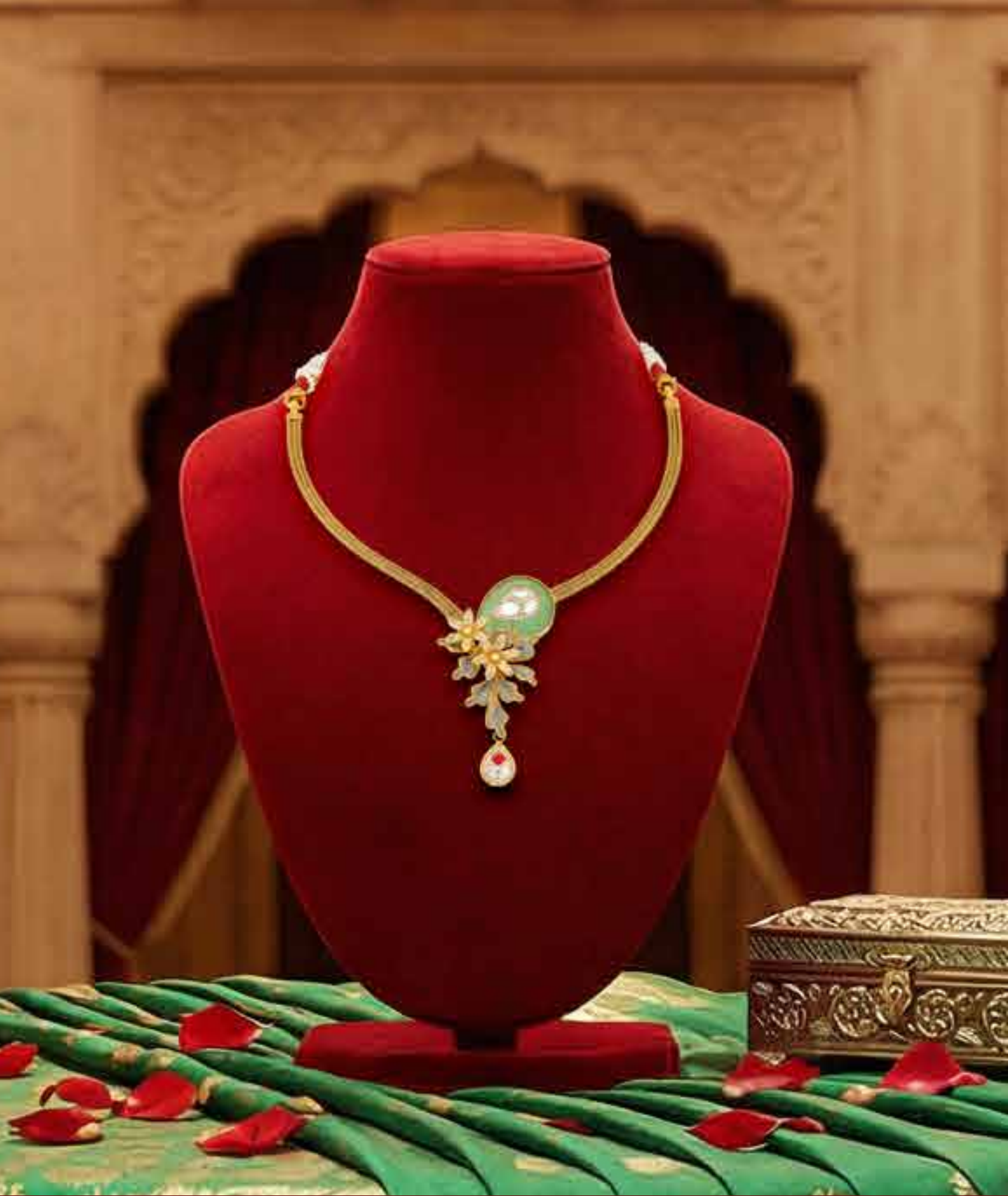
Featuring artistic motifs and elegant craftsmanship, this finely crafted gold necklace adds a refined and sophisticated finish to the bridal ensemble.