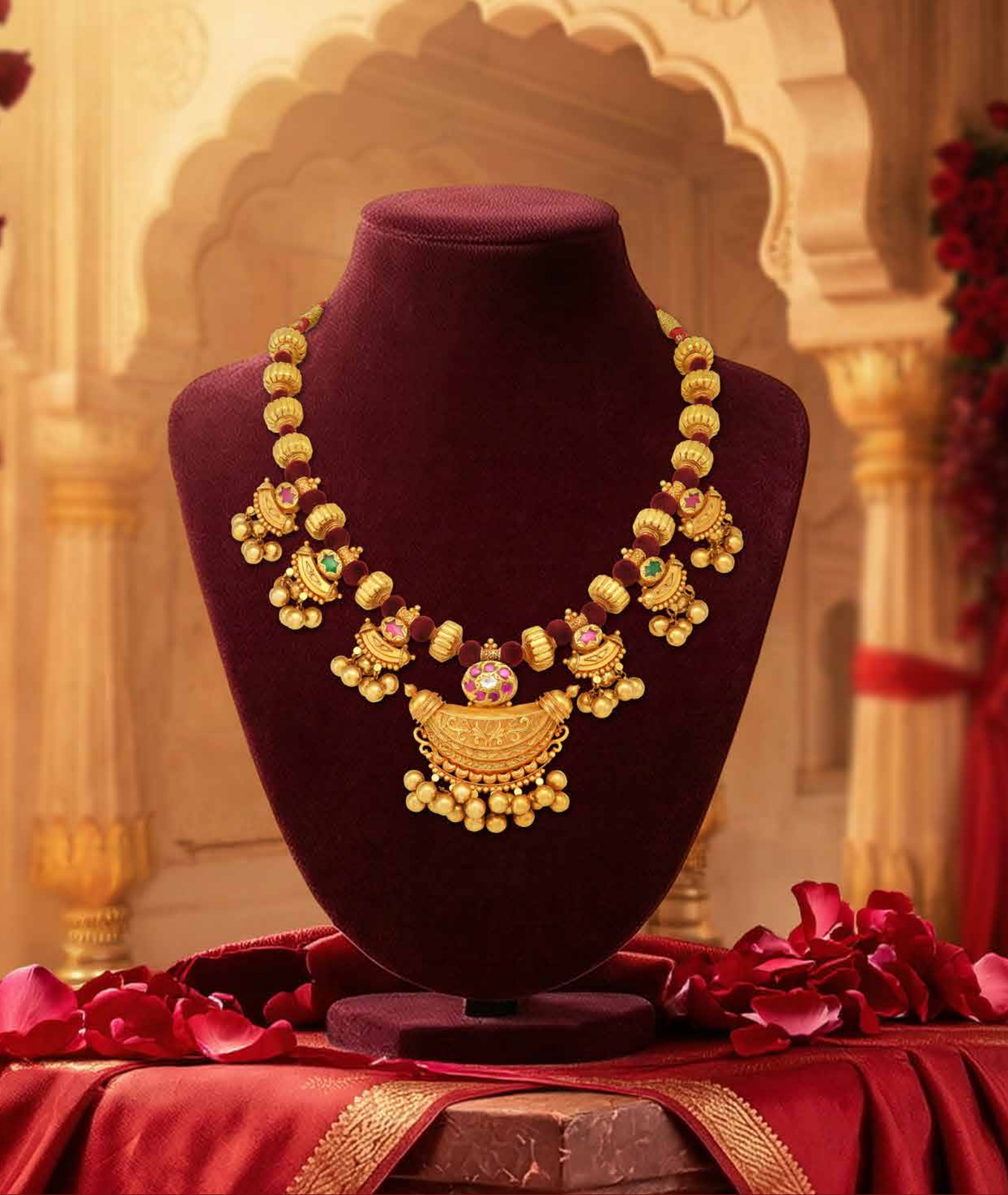
An intricately designed gold necklace featuring traditional motifs and delicate bead drops. The ornate piece beautifully reflects timeless charm and bridal elegance